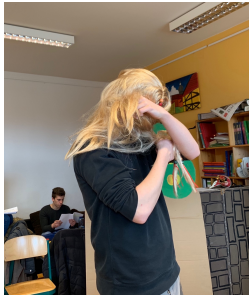
Wait I'm almost done...